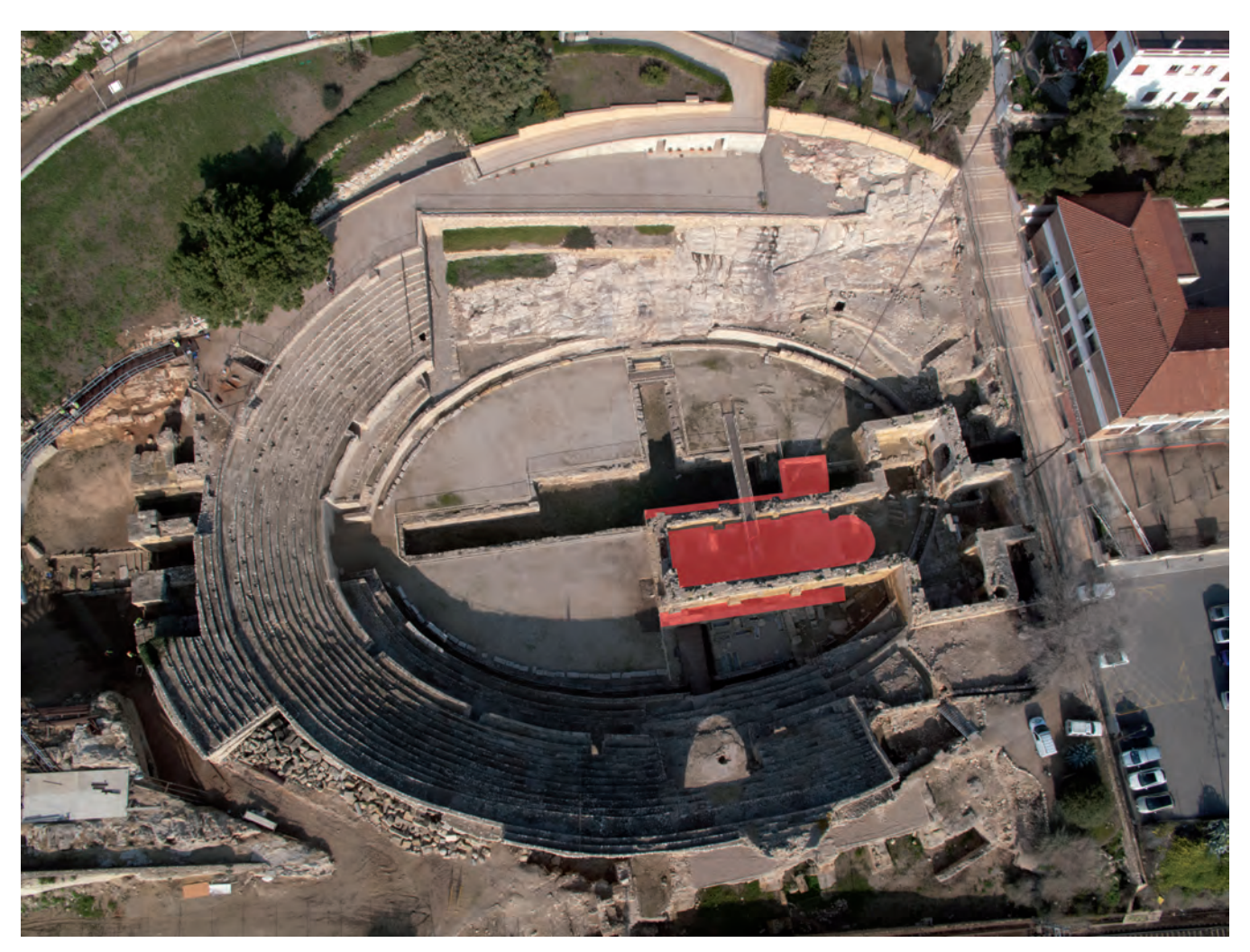
FIGURE 6. Aerial view of the amphitheatre of Tarragona with the two Christian basilicas.

tial in sustaining the operating costs of the urban and free-time facilities. What is more, the spread of Christianity influenced a disaffection towards traditional free-time practices in Roman society and naturally towards everything surrounding the imperial cult as a sense of belonging to the Empire.