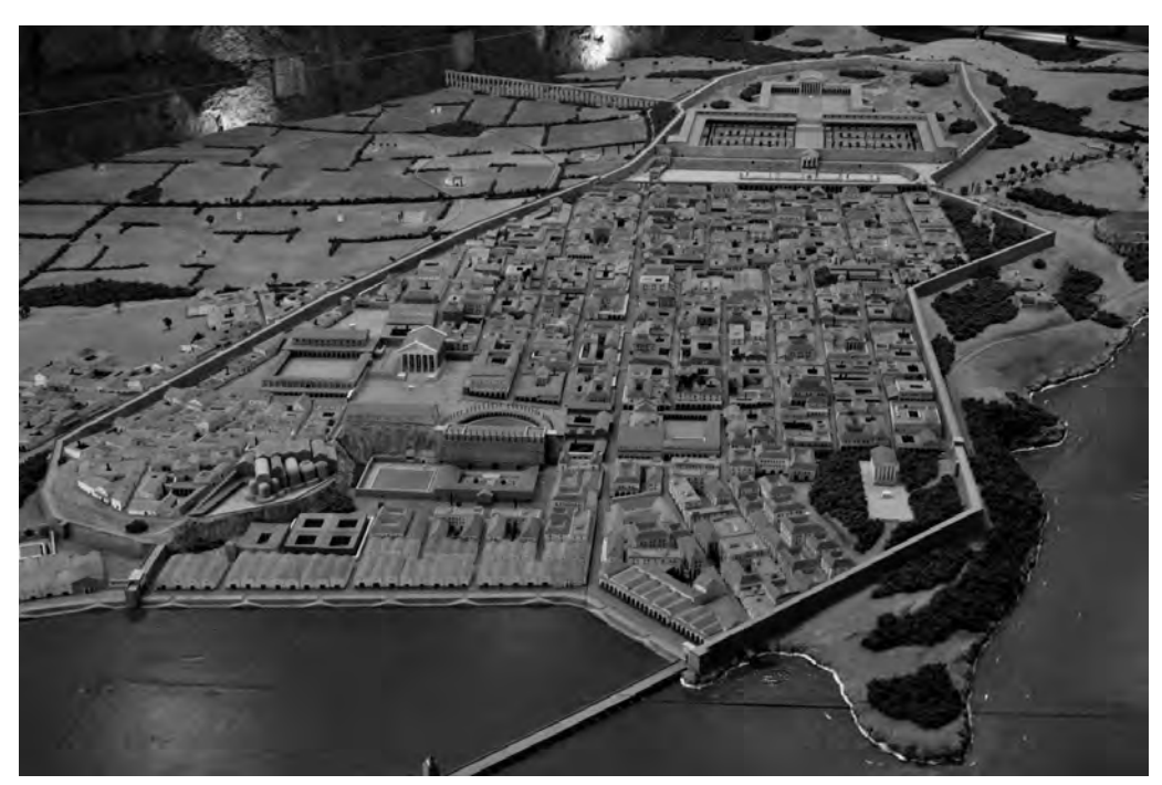
FIGURE 1. Educational model of Tarraco in the 2nd century. Re-creation of the suburbium and the port zone.

The Roman wall of Tarraco is an enormous vestige from this period. It is the first wall that Rome built outside Italy, and its Minerva Tower harbours the oldest inscription and sculpture from the western provinces.<sup>12</sup>