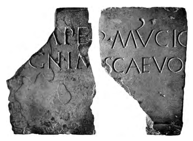
FIGURE 4. Opistographic inscription with double dedicatory (Pompeius Magnus and Mucius Scaevola), MNAT archive.

This, then, confirms a common feature of Mediterranean cities: the religious continuity of the most important areas in historical cities. The presence of the Roman temple under the mediaeval temple of Tarragona also forges a point of union with the construction of the Visigothic episcopium in this same spot.<sup>59</sup> All of this scholarly activity is summarised in the identification of the Temple of Augustus, built during the reign of Tiberius, on the city's upper platform right in the middle of a temenos that was dismantled during the course of the definitive remodelling of the acropolis in the Flavian period. The overall analysis of the first monumental project establishes the first adaptation of the site with little information and questions as to the degree to which it was completed, and with a series of indicators that point to the use of different urban development patterns than in the second phase.<sup>60</sup> The current hypotheses assert that the first sacred Augustan area was part of an area defined by the golden ratio, dovetailing morphologically with the coeval Hispanic fora where this pattern of measurement has been identified more consistently. On the other hand, the hypotheses