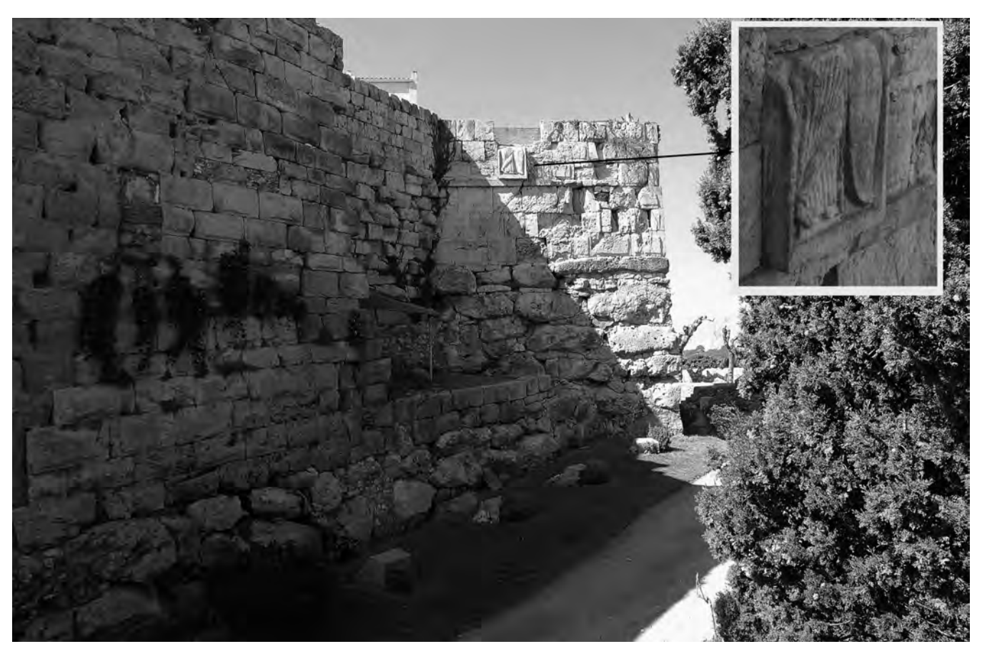
FIGURE 2. Minerva Tower sector; detail of the relief and two building techniques.

axis of the insulae. In the port zone, we have found signs of a republican roadway network under the Augustan theatre, and the prolongation of the city's collector (PAT-832) shows the continuity of the cardo maximus as far as the same bay where the port is located. Finally, we can observe how the expansion of the Augustan theatre matches the two late-republican insulae and how the adjacent exedra of the nymph retains the longitudinal axis of another block (PAT-83). With these elements, the location of the porta marina has been considered in relation to the city's cardo maximus, which was located in 1940 (PAT-351). This axis is assumed to be superimposed on the final stretch of the republican-era sewer (PAT-832, sheet 14) and became the axis separating the theatre compound from the city's early imperial port baths (PAT-355, fig. 43).