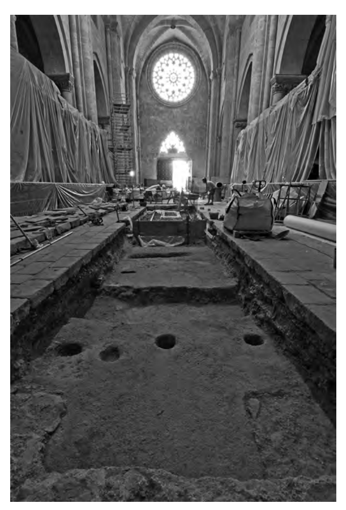
FIGURE 5. Close-up of the archaeological excavations in the cathedral of Tarragona, 2011.

of the imperial cult (CIL II^2/14 , 1109). The building was decorated by Elagabalus in the year 221 (Fig. 6), as we know from the large inscription that crowned the podium and was brilliantly restored by G. Alföldy (CIL II^2/14 , 921).